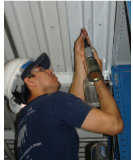
Figure A Invisi-Loc ® Underside Fastening System

Please contact Cornerstone Specialty Wood Products, LLC for product details, warranty, tool sales, and rentals.